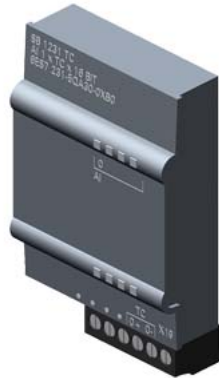
SIMATIC S7-1200, Analog input, SB 1231 TC, 1 AI thermocouples Type J or K